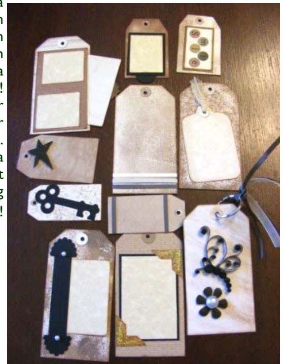
Tag Album Cover

With all of the tags included this month I just had to use some! For this project I cut out the tags and backed them with some of the other decorative papers to jazz up the back side and to give them a bit more thickness. You could even sandwich some thin chip board in between too. Next punch a hole in each tag so that you can insert a metal ring or tie with ribbon or both! Then decorate the pages however you like and add pictures of your favorite subject to share with others. This little album is easily tucked into a purse, so sharing is easy and what mom or grandma doesn't like a brag book!