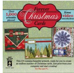
Christmas Card CD