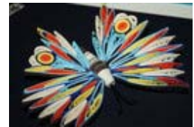
Cornelia Rada Quilling

At Custom Quilling: http://www.facebook.com/pages/Custom-Quilling-Supplies/59884235701