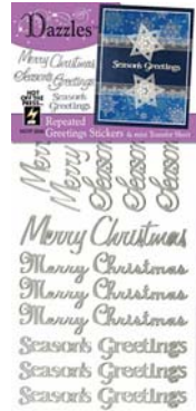
Stickers Gold or Silver