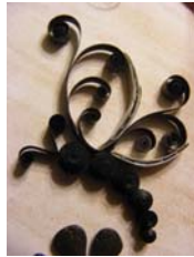
September Kit Pattern

http://www.customquillingbydenise.com/shop/cqmonthlykits-c-174.html