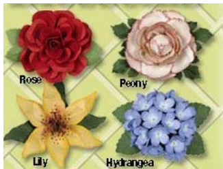
New line of Floral Punches & Tools Coming Soon!