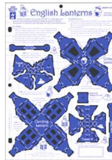
New English Lantern Template