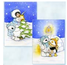
New Flower Soft Colors & Card Toppers