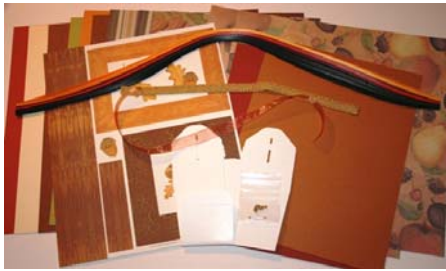
October Kit $19.99

http://www.customquillingbydenise.com/shop/products_new.php