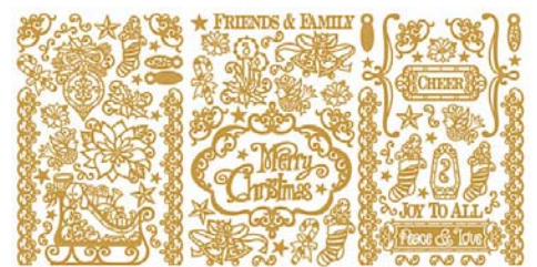
Loads of New Dazzle Stickers

Small card mailers, quilling strip storage bags, and card sleeves are all back in stock! Found under storage solutions.