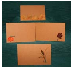
Free Kit Pattern