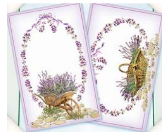
New Flower Soft Card Toppers