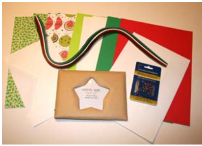
November Kit $17.99

http://www.customquillingbydenise.com/shop/products_new.php