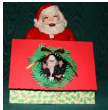
Free Kit Pattern