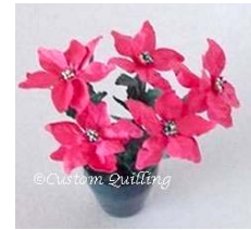
Imported Miniature Kits