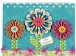
Free Pattern With Purchase of Pleated Template