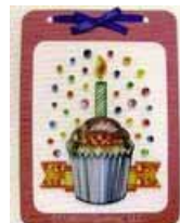
New Quilling Card Kit