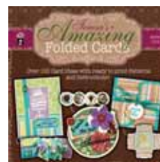
Folded Card CD