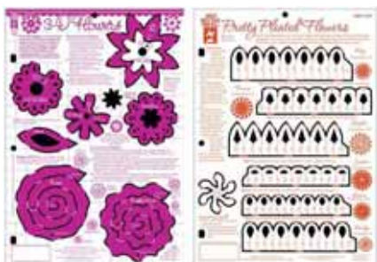
New Flower Templates