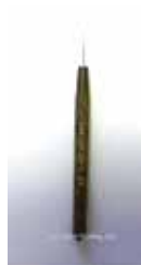
New Fine Slotted Tool