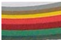
Sparkling Holiday Strips