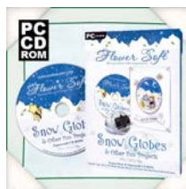
Flower Soft CD Rom