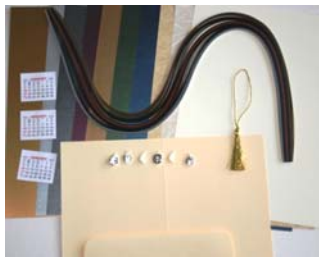
December Kit $18.99

http://www.customquillingbydenise.com/shop/products_new.php