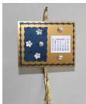
Free Kit Pattern