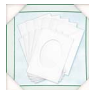
Aperture Card & Domes