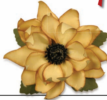
Photo images are for technique demonstration only. Flower petals may not match this project.