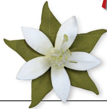
Photo images are for technique demonstration only. Flower petals may not match this project.