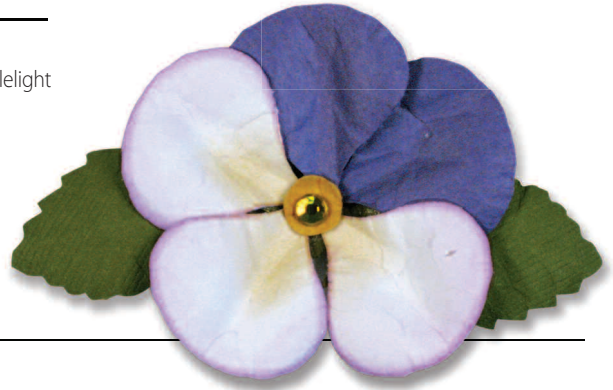
Photo images are for technique demonstration only. Flower petals may not match this project.