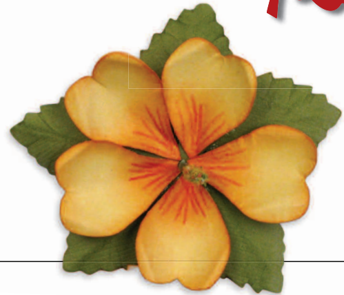
Photo images are for technique demonstration only. Flower petals may not match this project.